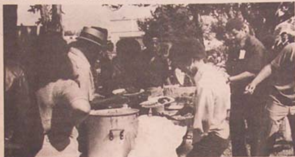
"...We cannot even dream of moving forward unless you can deal with the concept of a unified people in a unified community..." (CHAIRMAN BOBBY SEALE)

BLACK PANTHER PARTY HONORS DEDICATED BROTHERS AND SISTERS IN FIRST COMMUNITY WORKERS DAY COMMEMORATION.