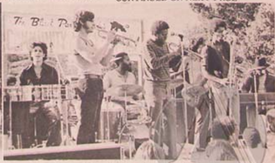
Members of the THIRD WORLD BAND performed for everyone attending the Community Workers Day commemoration.