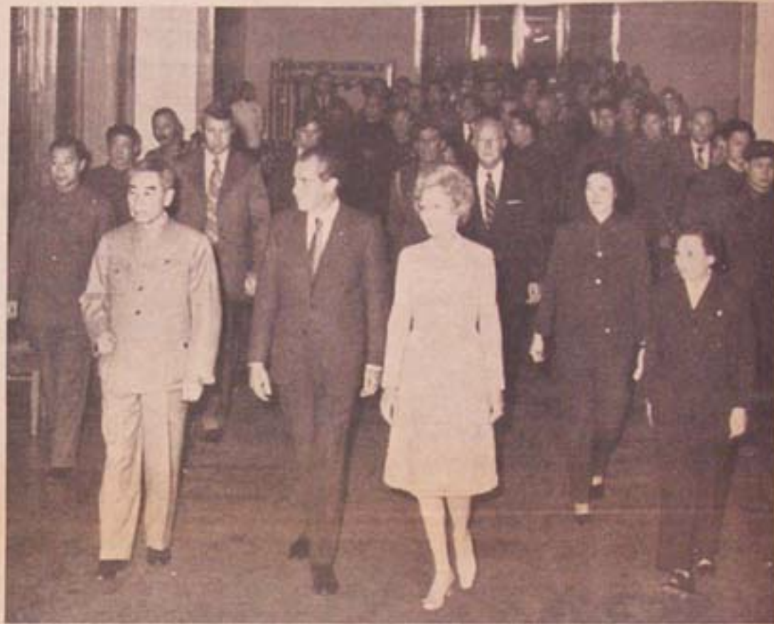
According to Horowitz, "Nixon's visits to Peking and Moscow marked the satisfactory completion of the first two stages of his (Vietnam) pacification strategy."

Recalling China's stance in this incident provokes two immediate reflections. First, the current Chinese response (or lack of response) to Wash-