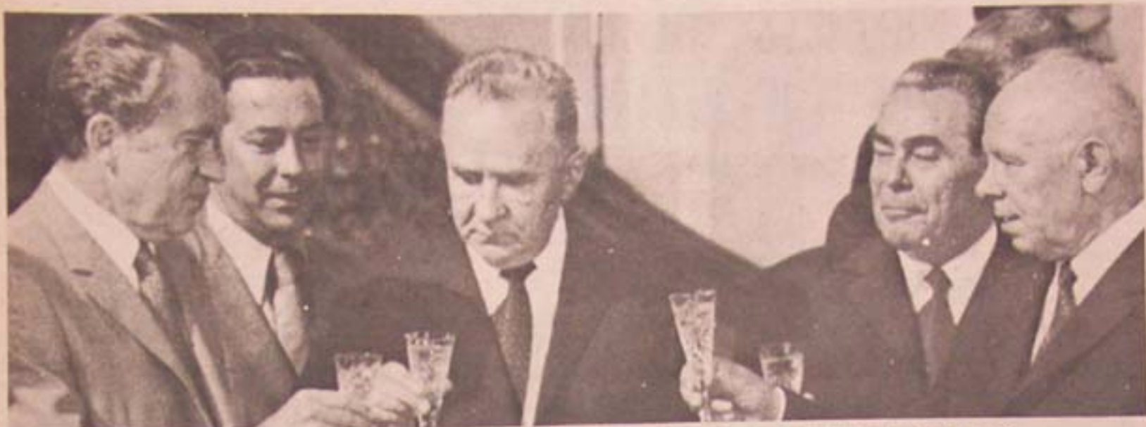
"The Russians, in point of fact, have wanted a compromise settlement in Vietnam all along..."