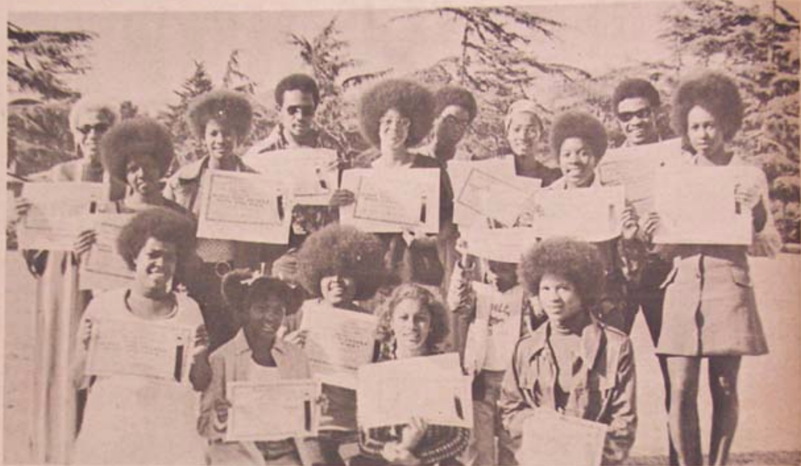
In the relaxed atmosphere of Arroyo Viejo Park, amidst enjoying barbeque, entertainment and the common experience of being together, Black Panther Party COMMUNITY WORKERS were awarded COMMUNITY SERVICE CERTIFICATES.