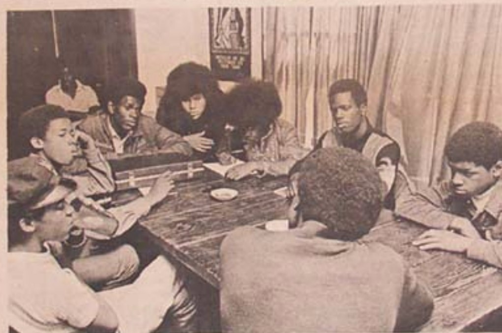
CHAIRMAN BOBBY SEALE found the members of the ZODIAC ORGANIZATION willing to learn from those who really serve the community's needs.

Black youth have, because of no place to go, no meaningful activity in which to engage, traditionally been involved in street gangs. Although the power structure pretends to want to eliminate the gangs, it secretly supports the divisiveness gang activity produces in our communities.